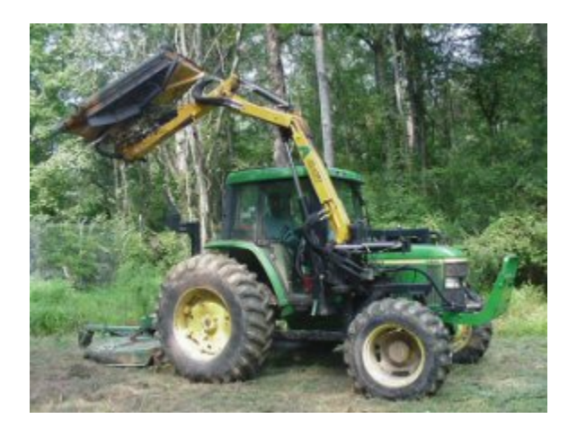
Our annual easement mowing and clearing work normally begins in the spring and is completed in the late fall, but wet weather and storm debris can affect our progress.