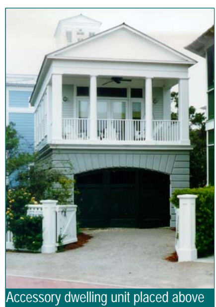
a detached garage

Continue allowing accessory and integral additional housing units that are associated with single-family detached units. Ensure that conversions of single-family properties do not disrupt the character of existing neighborhoods.