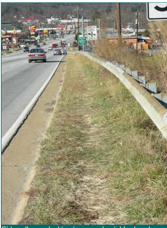
Sidewalks are lacking in several neighborhoods and on the major roadways that connect them to one another, such as this section of Spartanburg Highway. As a result, these neighborhoods are isolated from one another and are unsafe for pedestrians.