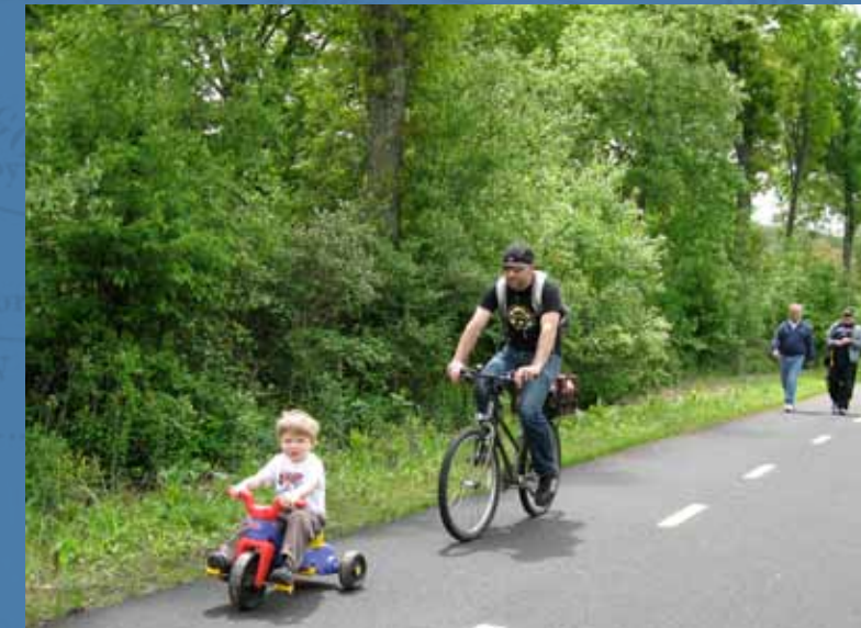
The completed trail will provide transportation and recreation opportunities for residents and visitors.

An operations and management plan for the Ecusta Rail Trail should be embraced by the entities responsible for maintaining the rail trail at the beginning of the implementation process. In addition, community groups, residents, business owners, developers and other stakeholders should be engaged in the long term stewardship of the resources preserved and enhanced by the management plan.