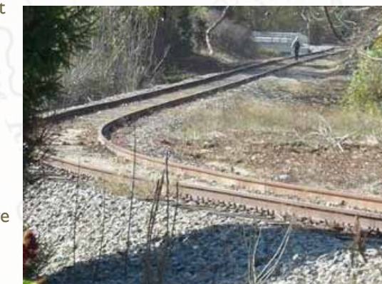
In some areas the rail line is well traveled by pedestrians as it connects several popular destinations.