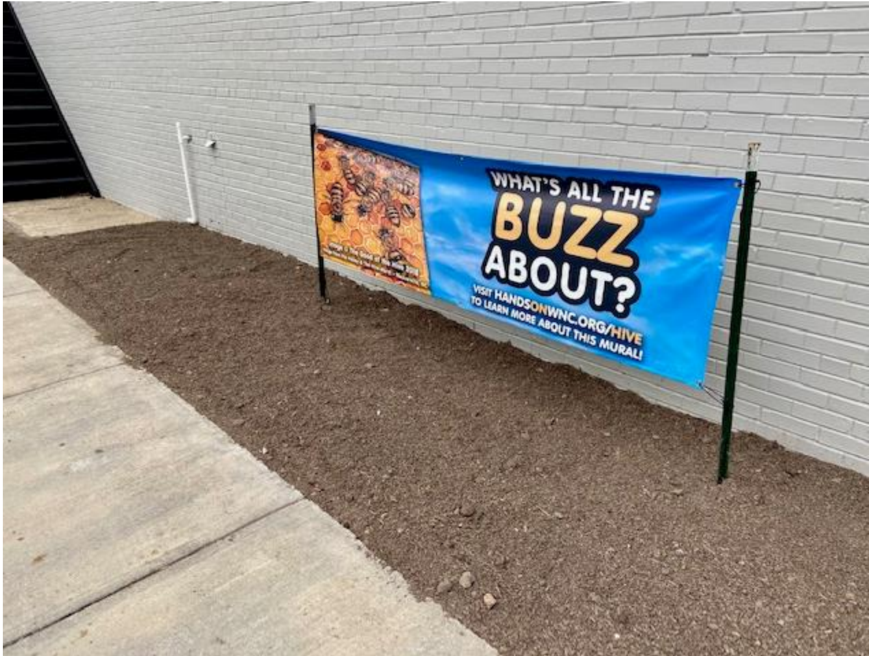
Final garden bed (between sidewalk and mural wall) ready to be planted after the bee mural is completed in the spring. )